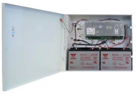
Figure 7 – Battery backup supply

The ELMDENE Battery Backup Power Supply is a regulated 27.6V DC output, which is capable of supplying a total of 10 Amps continuously into the load, whilst also enabling battery charging. The power supply output features electronic short circuit protection under both mains and standby operation. Two 17Ah batteries (in series to provide 24V DC) allow full operation of the product for a limited period in the event of a power failure. The battery backup will resume normal operation once mains supply is restored. Product use should be kept to a minimum during mains failure to maintain battery efficiency.